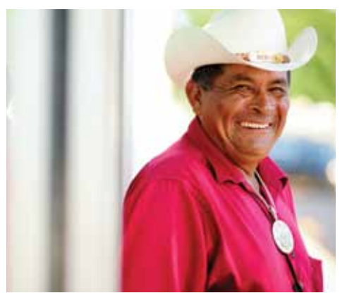
WILD FLOUR BAKERY