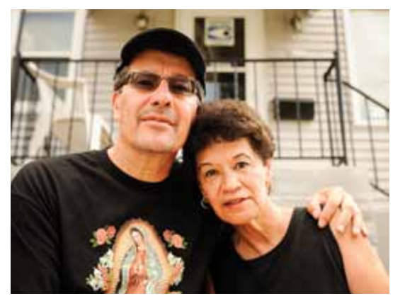
NATIVITY JESUIT MIDDLE SCHOOL